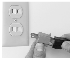
Fig. 6-2 Incorrect