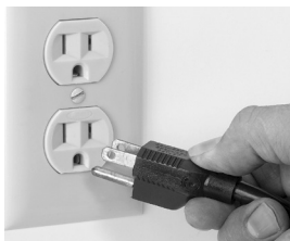
Fig. 6-1 Correct

THIS MACHINE IS PROVIDED WITH A THREE-PRONG GROUNDING PLUG. THE OUTLET TO WHICH THIS PLUG IS CONNECTED MUST BE PROPERLY GROUNDED. IF THE RECEPTACLE IS NOT THE PROPER GROUNDING TYPE, CONTACT AN ELECTRICIAN. DO NOT UNDER ANY CIRCUMSTANCES CUT OR REMOVE THE THIRD GROUND PRONG FROM THE POWER CORD OR USE ANY ADAPTER PLUG (Fig. 6-1 and Fig. 6-2).